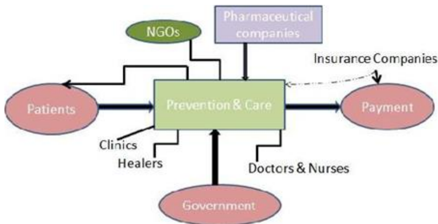
Figure 1: The Health-Care System

If we think of it from an economic standpoint when someone is sick, they go to a hospital or clinic where they are cared for by physicians or nurses, and they pay for this service. And the majority of the preventatives they did not provide as an increment would be completed, which means a doctor would take care of a patient and after healing the illness, the patient would be required to pay a certain sum. There are several illnesses that affect people all around the world. The government is the most prominent aspect. The governments of different nations have tried a variety of ways to improve their healthcare systems, all with the goal of achieving the greatest possible results. Figure 1 depicts the complete healthcare system in its entirety.