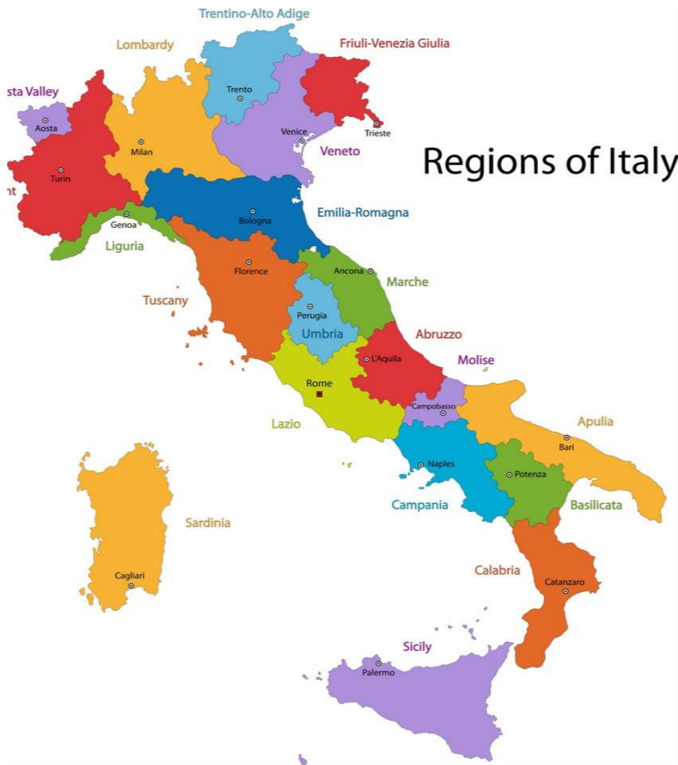
Figure 1: Map of Italy

deaths), Autonomous Province of Bolzano (1,835 with 183 deaths), Umbria (1,289 with 50 deaths), etc. On 15 May 2020, infected regions in Italy are Lombardy (84,342 with 16,000 deaths), Piedmont (29,370 with 3,400 deaths), Emilia-Romagna (27,100 with 3,955 deaths), Veneto (18,880 with 1,764 deaths), Tuscany (9,890 with 982 deaths), Liguria (9,080 with 1,345 deaths), Lazio (7,330 with 610 deaths), Marche (6,618 with 977 deaths), Campania (4,650 with 395 deaths), etc. (Worldometer, 2020).