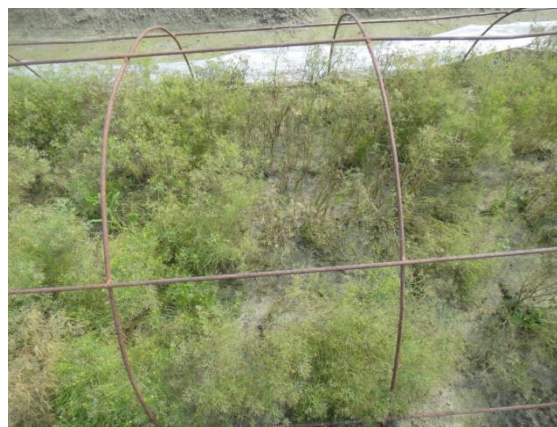
Plate 3: Control plot