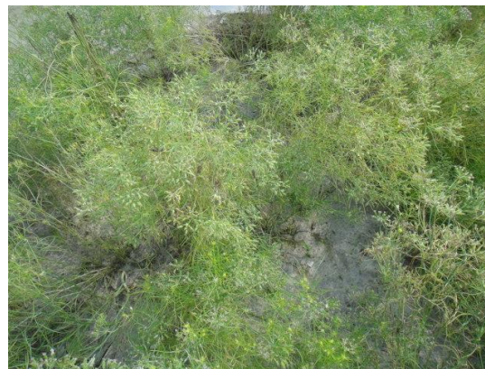
Plate 2: Provax treated plot