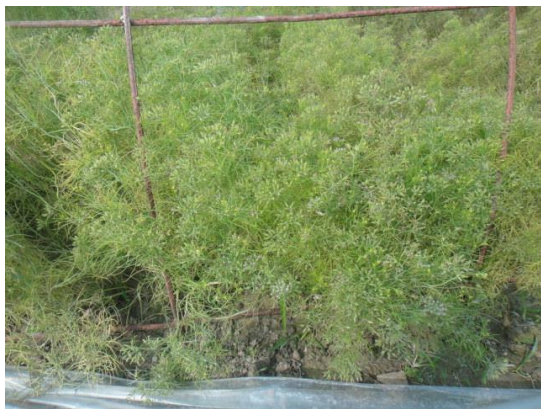
Plate 1: Bavistin treated plot