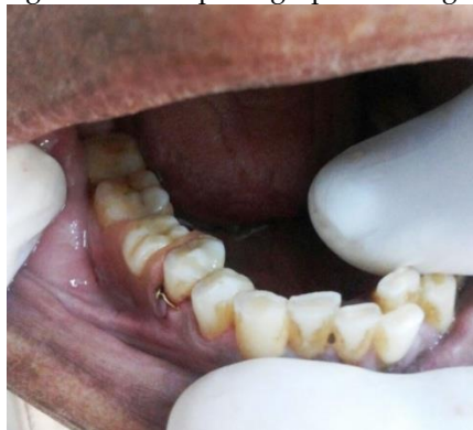
Fig. 2: Figure showing the procedure of the removal of the quack denture

Fig. 1: Intraoral photograph showing replacement of the missing mandibular molar done by the quack dentist